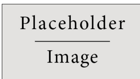
Figure 3.1: Figure caption