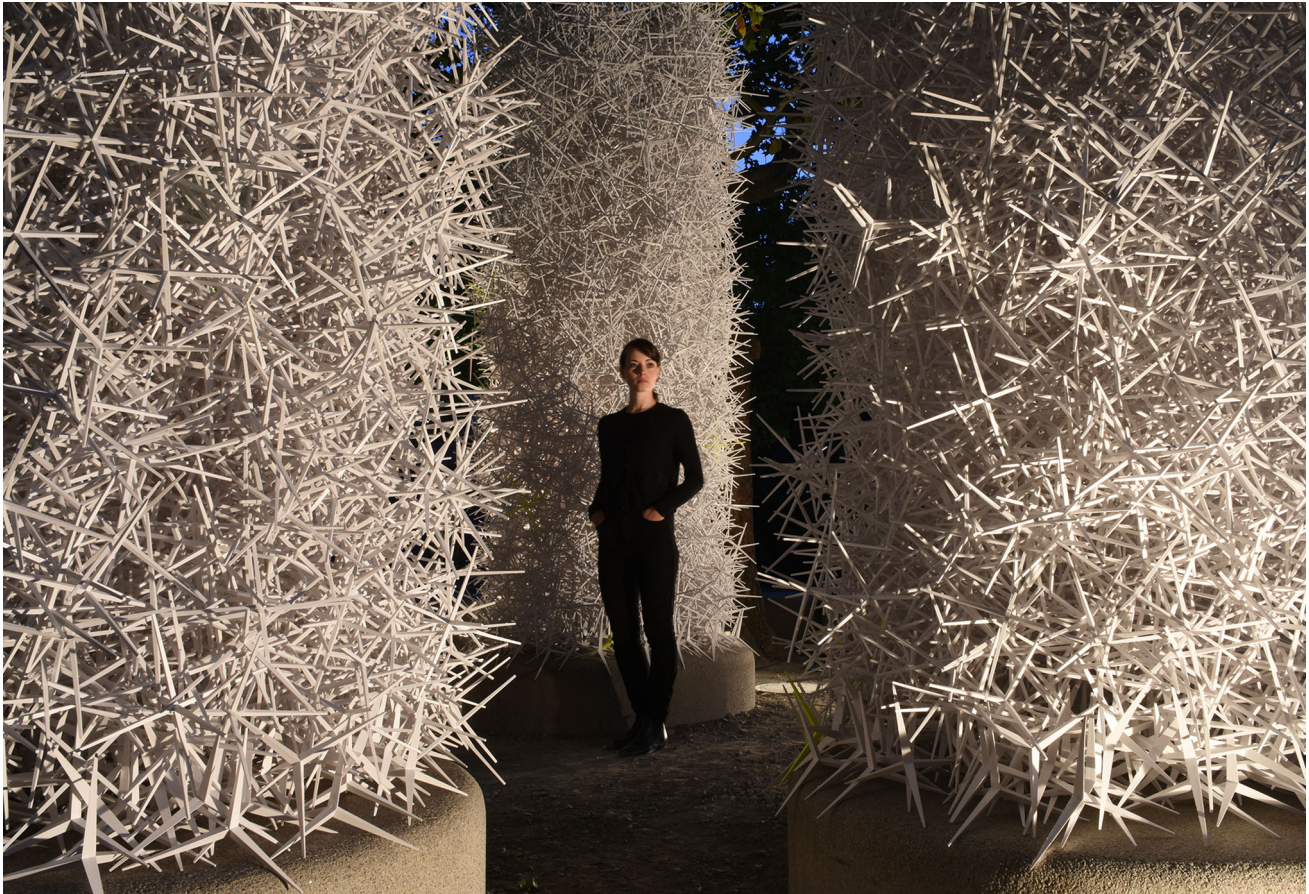
Fig. 1 The ICD Aggregate Pavilion 2015 explores vertical structures as space forming elements. Programmed verticality is one of the core features which a specific set of non-convex designed granular systems can achieve

Aggregates, especially designed aggregates, are a material system that challenges current paradigms of architectural design practice: architects conventionally control both geometry of the local element and the exact overall global geometry of a structure through precise drawing techniques when working with a designed aggregate system however, the geometry of the individual part, the granule, is defined not to achieve precise geometry but rather to calibrate a certain material behaviour with a scope of possible formations. This paradigm shift requires and promotes an entire new set of concepts, methods and practical tools: the conceptual design thinking needs to move from designing a finite structure towards an evolving formation, which moves from one stable state to the other; methods need to be based in the realm of information processing rather than artistic design intentions, thus gathering data from the granular system itself rather than imposing a preconceived form onto the system; and finally adequate tools and technologies both in terms of physical experiments and numerical simulations need to be integrated into the design discipline, frequently drawing from and building on techniques developed in granular physics [7].